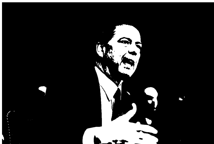
FBI Director James Comey before the Senate Select Committee on Intelligence on Tuesday.

Top lawmakers already have inquired publicly about the kinds of issues described in the memos. In a hearing Tuesday with four top intelligence officials, Sen. Ron Wyden (D., Ore.) asked FBI Director James Comey if the bureau had investigated whether individuals close to the Trump campaign have any links to Russians. Mr. Comey declined to answer, saying he couldn't confirm or deny if an investigation had begun.