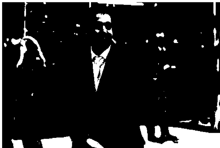
Michael Cohen, an attorney for President-elect Donald Trump.

"I have never been to Prague in my life. #fakenews," Cohen tweeted. He included a photo of his passport.